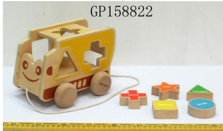
PHOTOGRAPH(S) OF THE SAMPLE FOR THE TEST